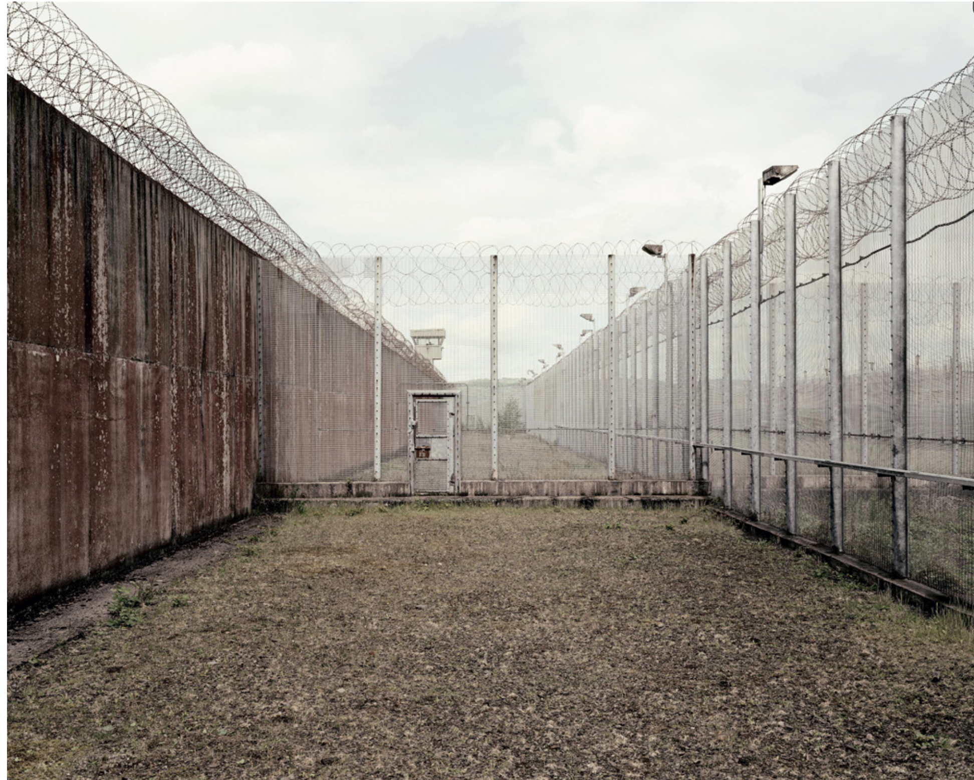
Donovan Wylie Sterile, Phase 1. The Maze Prison. Northern Ireland. 2003.