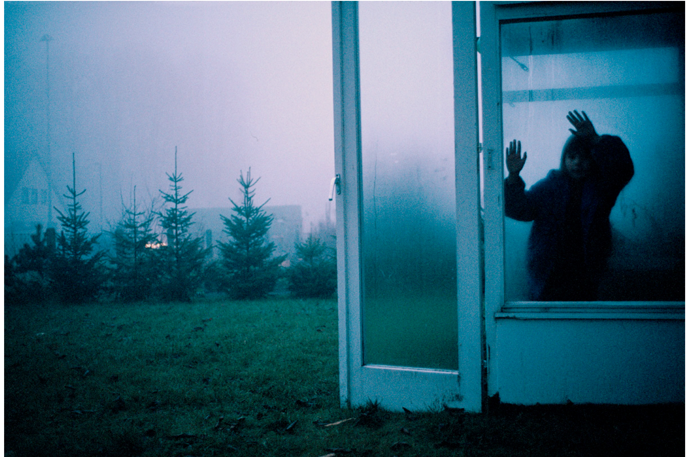
Berlin Wall. Hanover. Germany. 1989.