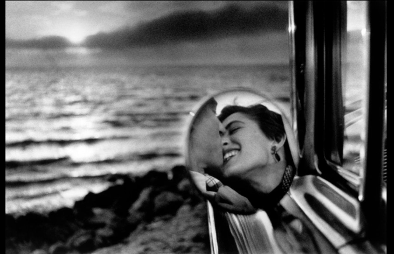
Elliott Erwitt California. USA. 1955.