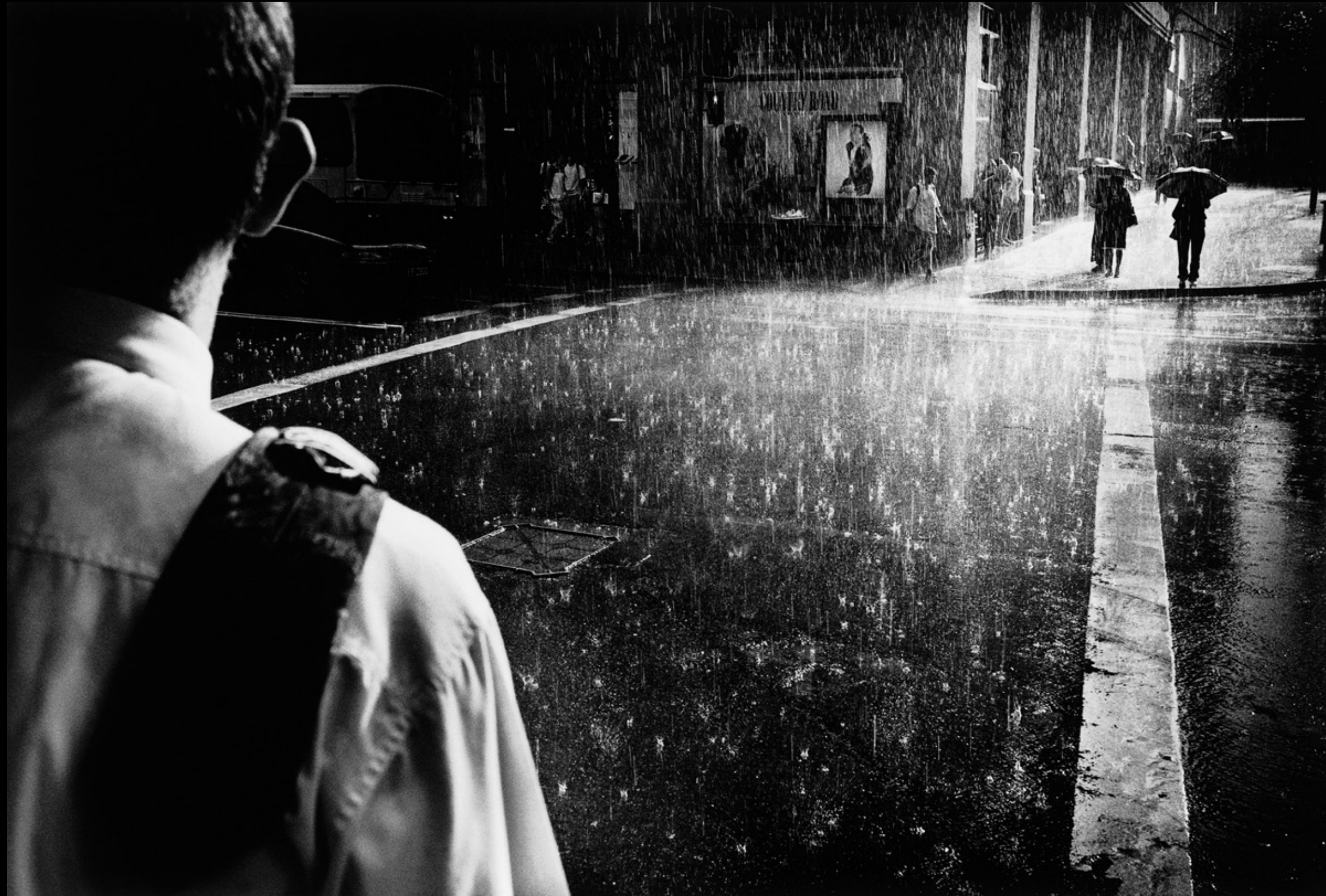
A man stands huddled under awnings on the corner of George & Market st. His tie thrown over his shoulder after running through a Sydney thunderstorm. Summer rain. From Dream/Life series. Sydney, Australia. 1998.