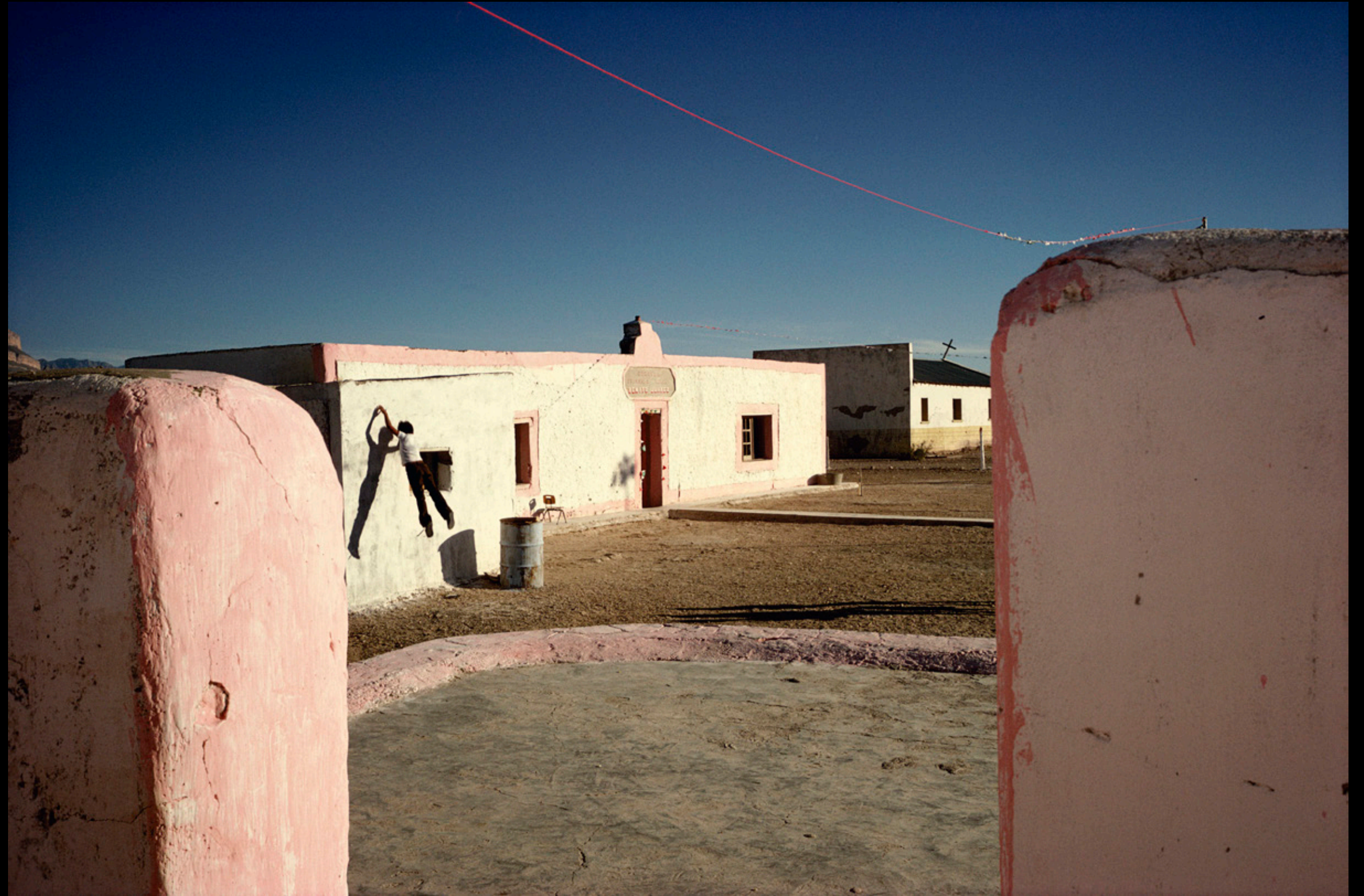
Alex Webb Jumping. Boquillas (Border). MEXICO. 1979. Image © Alex Webb/Magnum Photos.