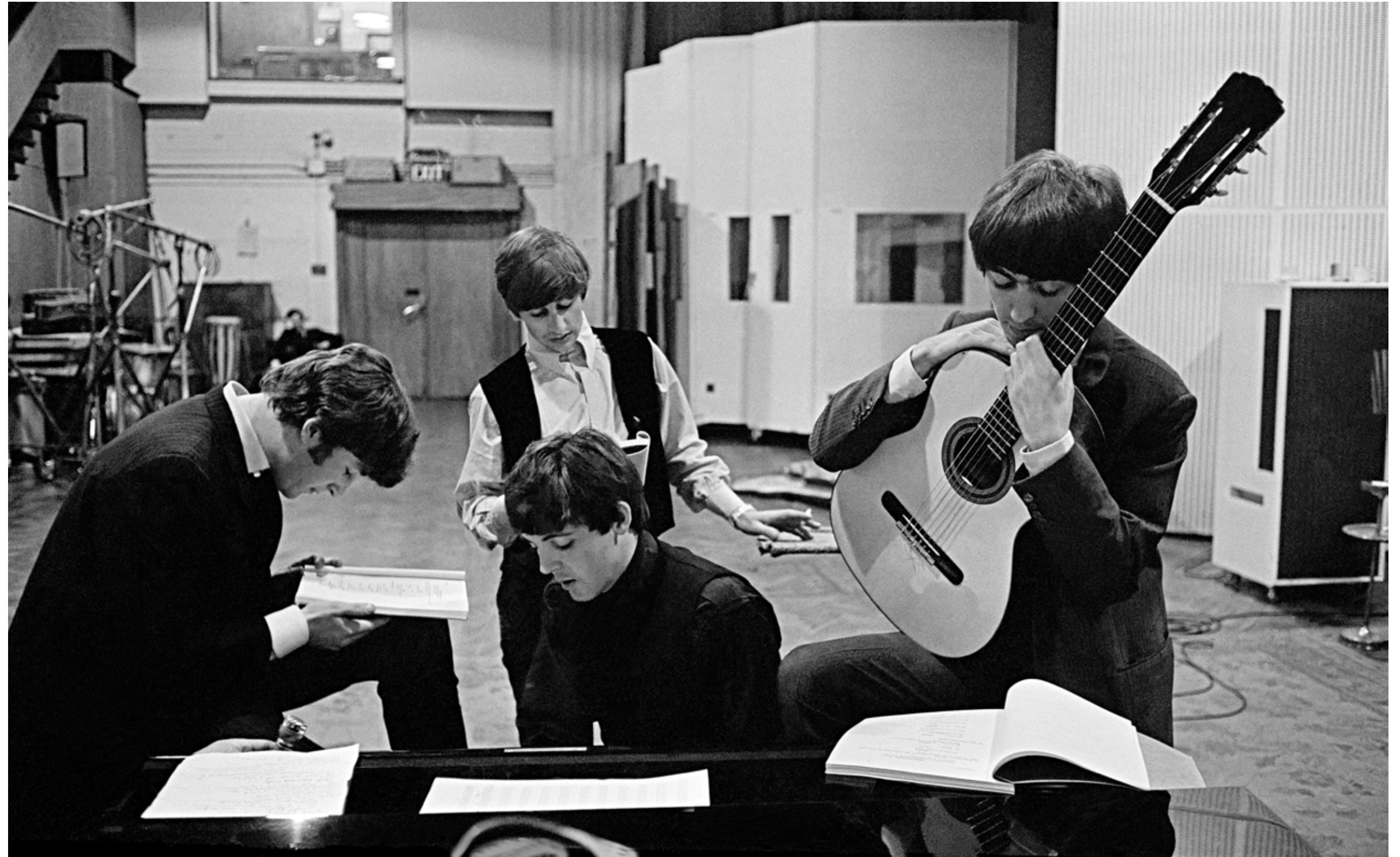
David Hurn The Beatles in the Abbey Road Studios, where many of their most famous records were made, examining the script of the film 'A Hard Days Night'. London. England. 1964. Image © David Hurn/Magnum Photos.