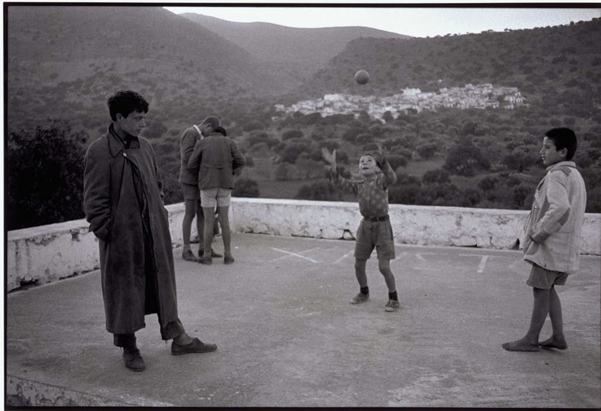
Constantine Manos Playing in the square. Elounta. Crete. Greece. 1964. Image © Constantine Manos/ Magnum Photos.