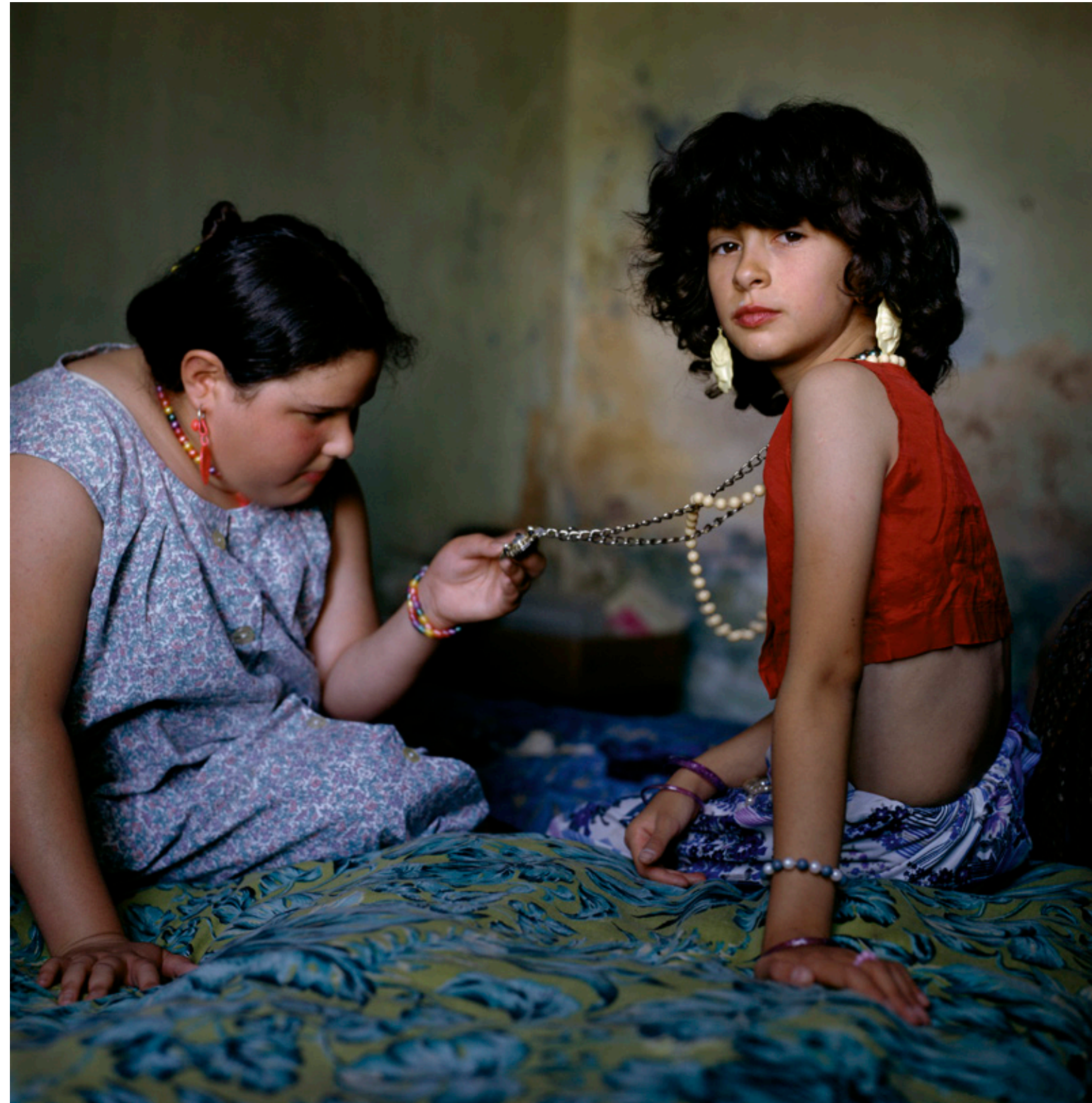
Alessandra Sanguinetti The Necklace. Buenos Aires. Argentina. 1999.