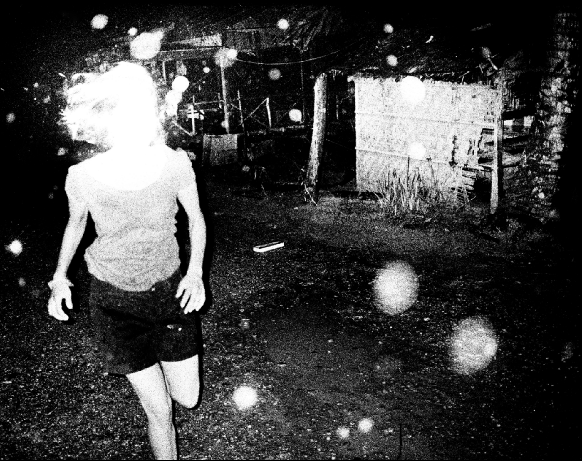
Sohrab Hura Stormy night. Laos. 2011.