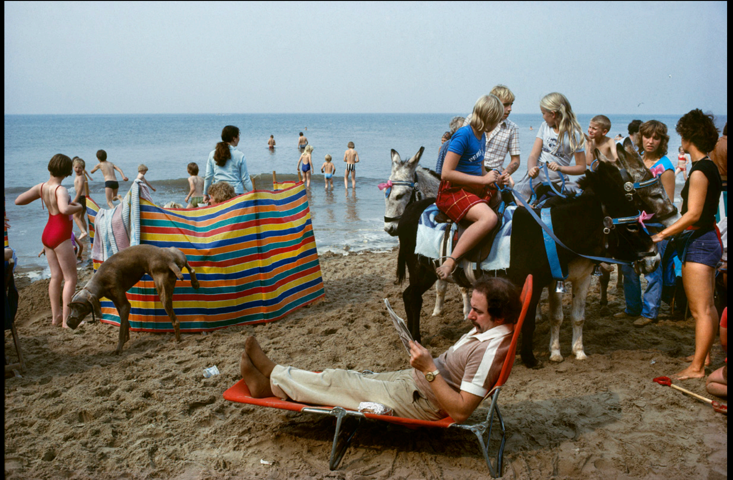
Chris Steele-Perkins Blackpool, England, 1982.