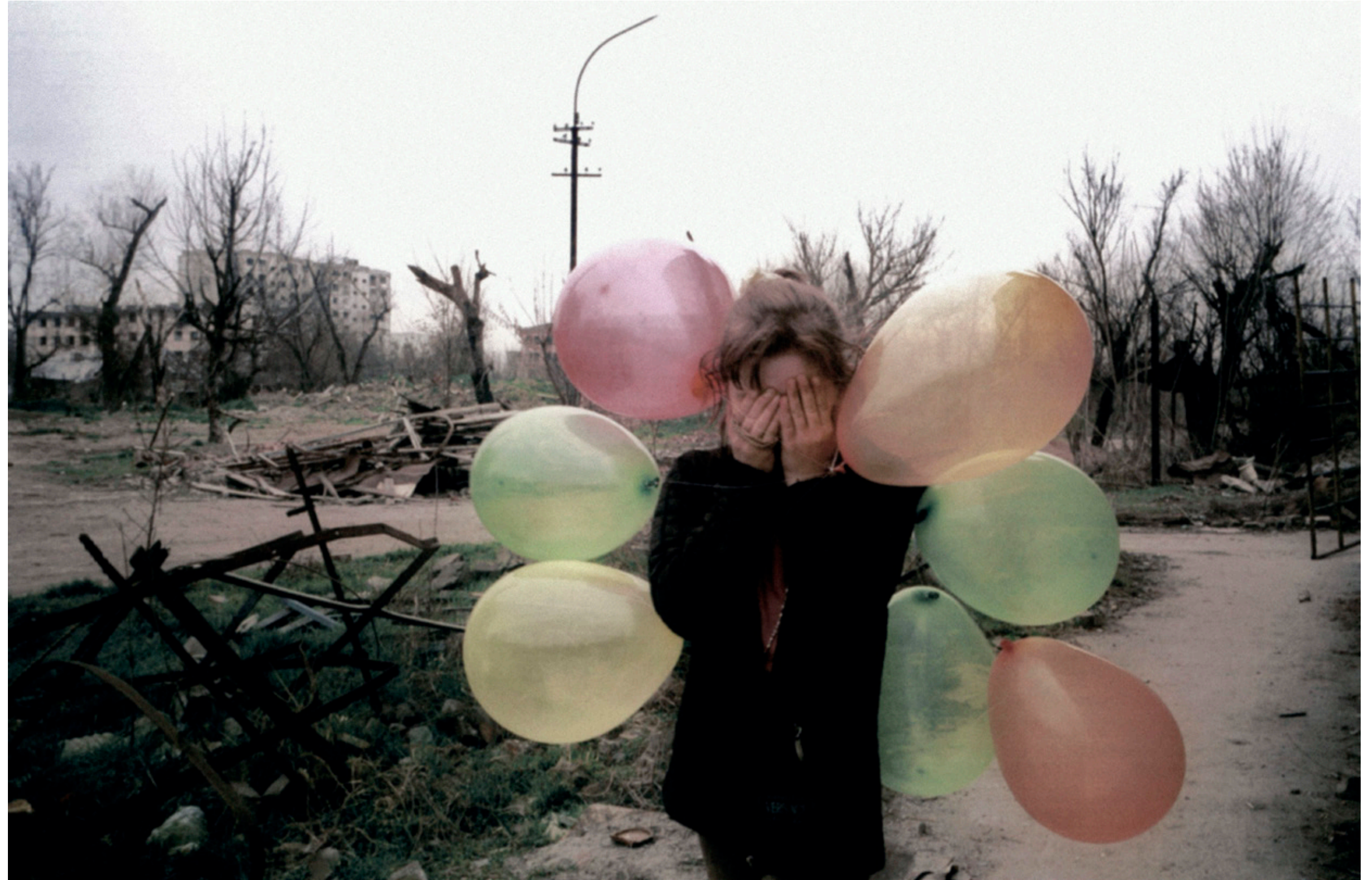
Girl with balloons. Destruction in the city center. Nothing has been rebuilt since the two wars. Grozny, Chechnya. RUSSIA. March 2002.