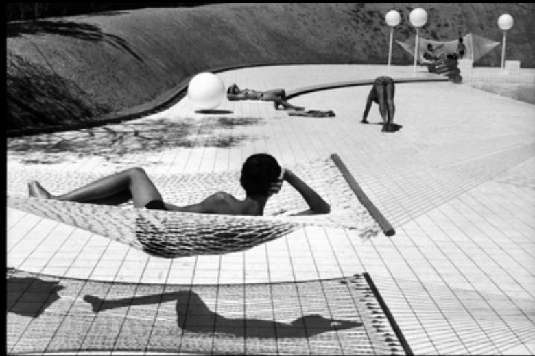
Martine Franck Pool designed by Alain Capeilleres. Town of Le Brusac. Provence. France. 1976. Image © Martine Franck/Magnum Photos