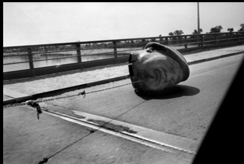
Abbas A bronze head of President Saddam Hussein is paraded in the streets after US troops occupied the capital. Baghdad. Iraq. 2003. Image © A. Abbas/Magnum Photos