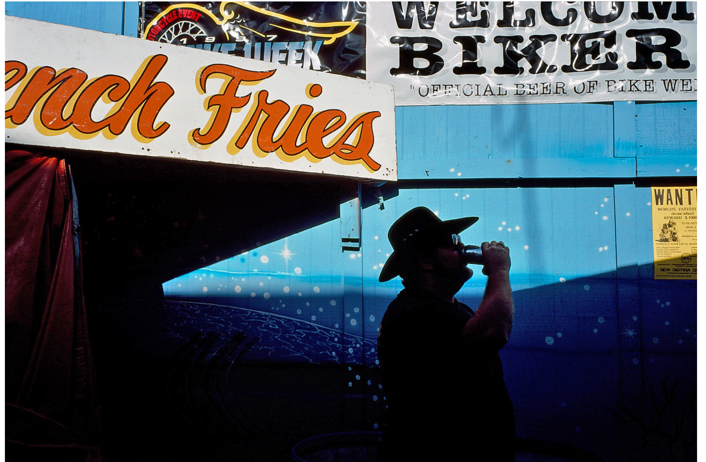
Constantine Manos Florida, USA, 1997. Image © Constantine Manos/Magnum Photos