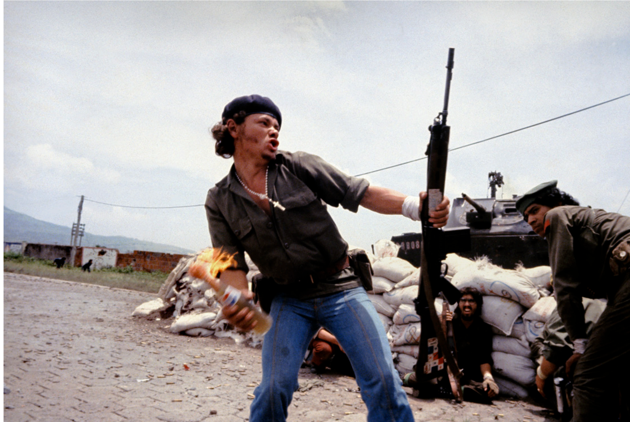
Susan Meiselas Sandinistas at the walls of the Esteli National Guard headquarters. Esteli, Nicaragua. 1979.

“Dig in, follow your instincts and trust your curiosity.”