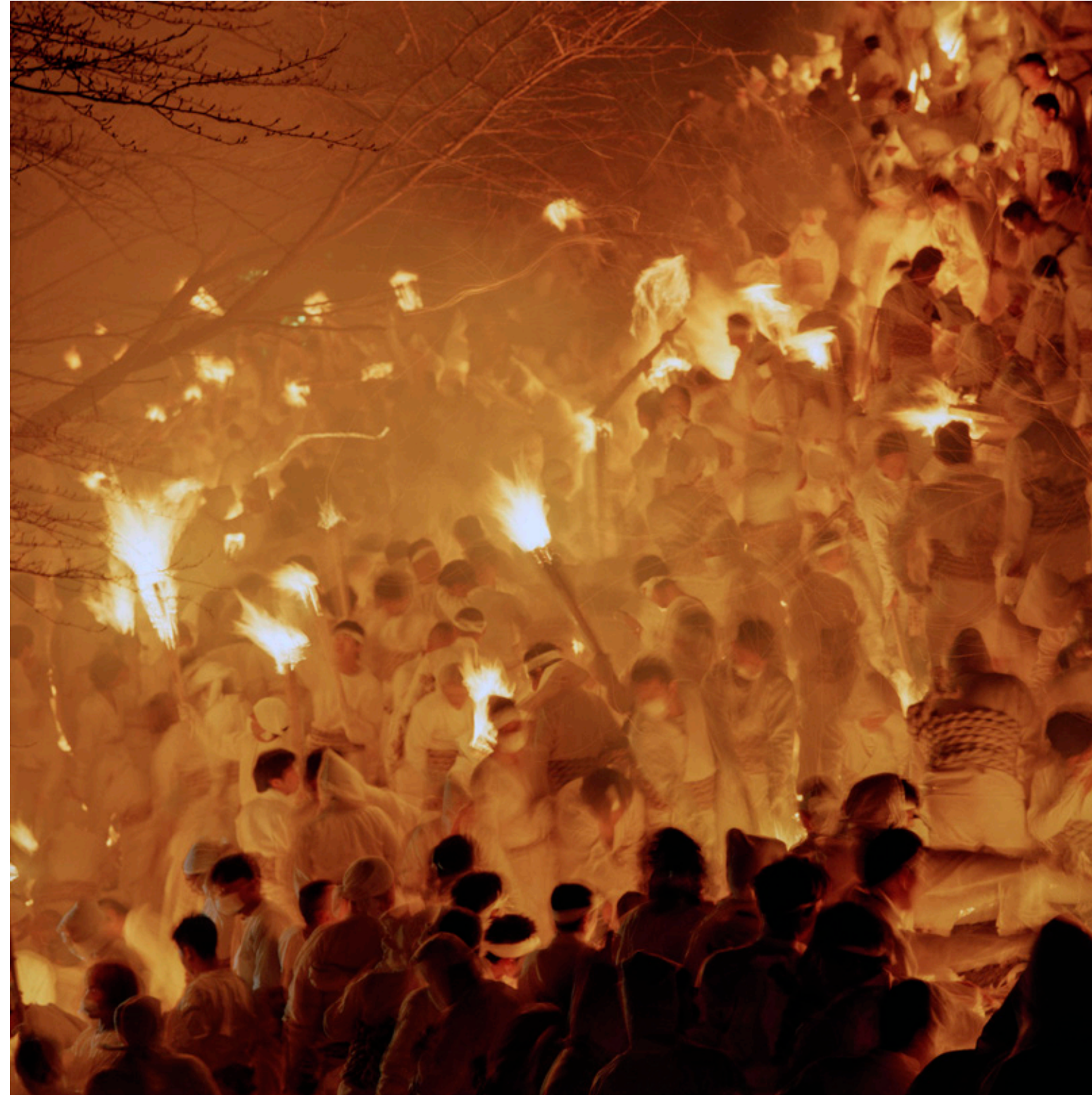
Peter Marlow Shingu-Koza-Kamikura bonfire festival, 2000 men run down a mountain with flaming torches and dresses in white, in a celebration of "manhood"; no women are allowed on the mountain. Prefecture of Wakayama. Japan. 1998. Image © Peter Marlow/Magnum Photos.