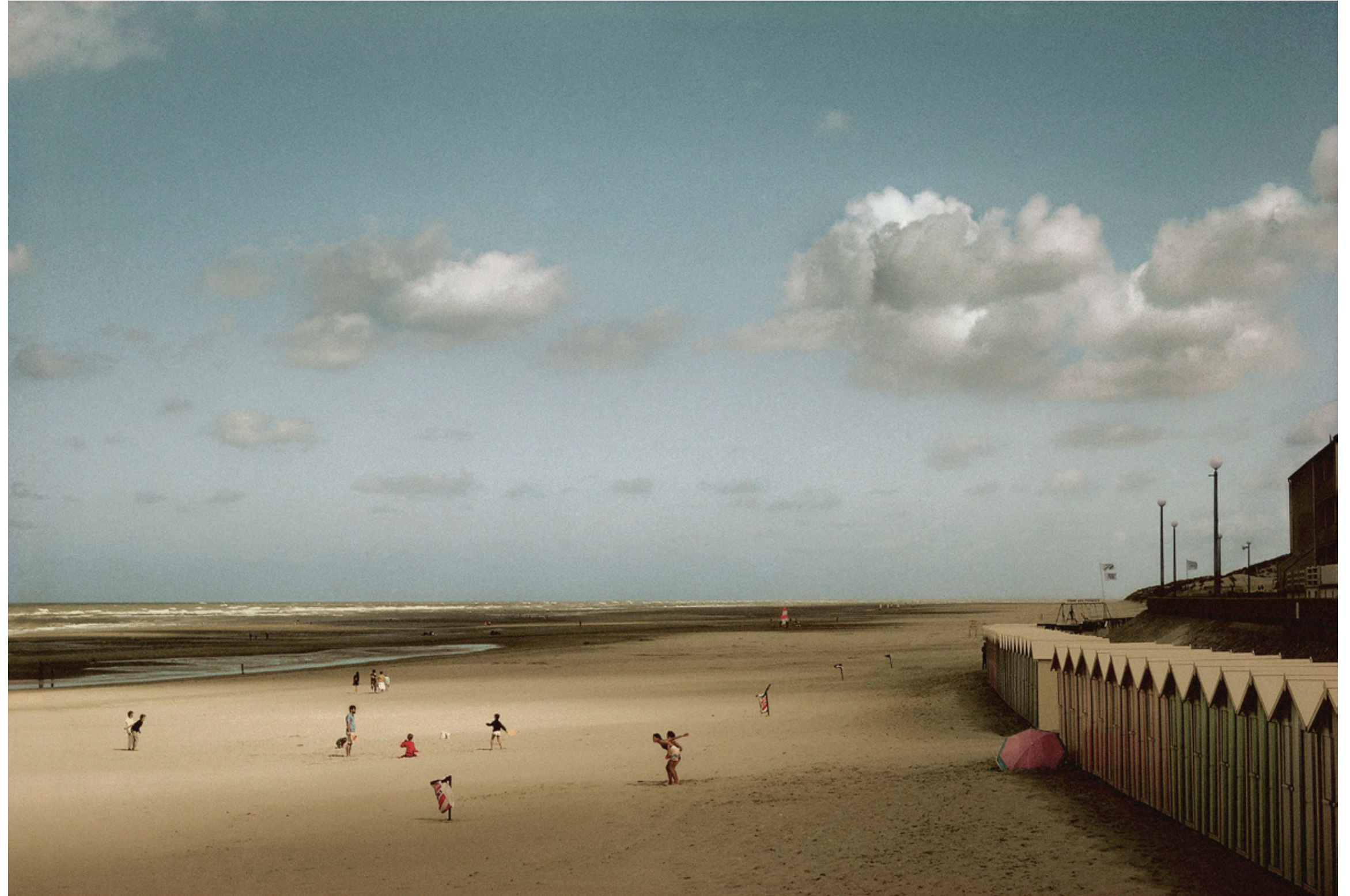
Harry Gruyaert Bay of the Somme river. Somme departement. Fort Mahon. Picardie region. France. 1991.