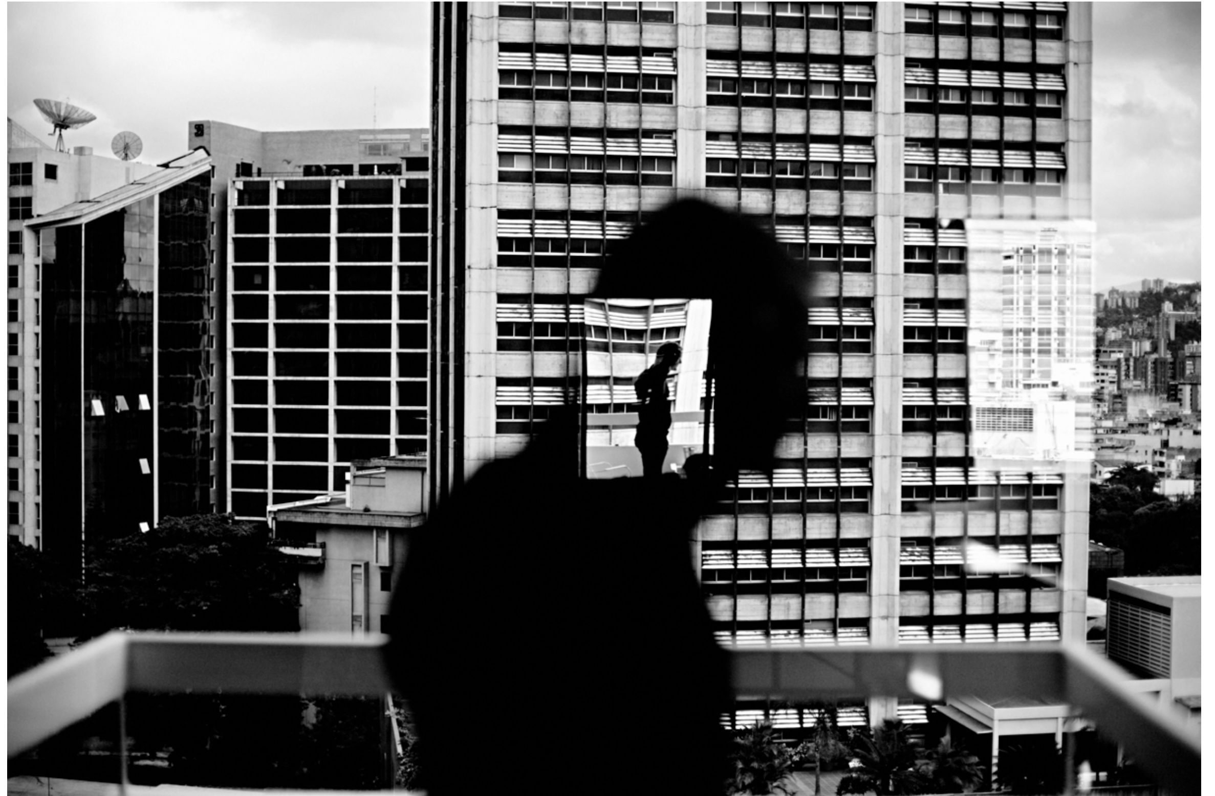
Christopher Anderson Reflection in window in Altamira. Caracas, Venezuela. 2006.