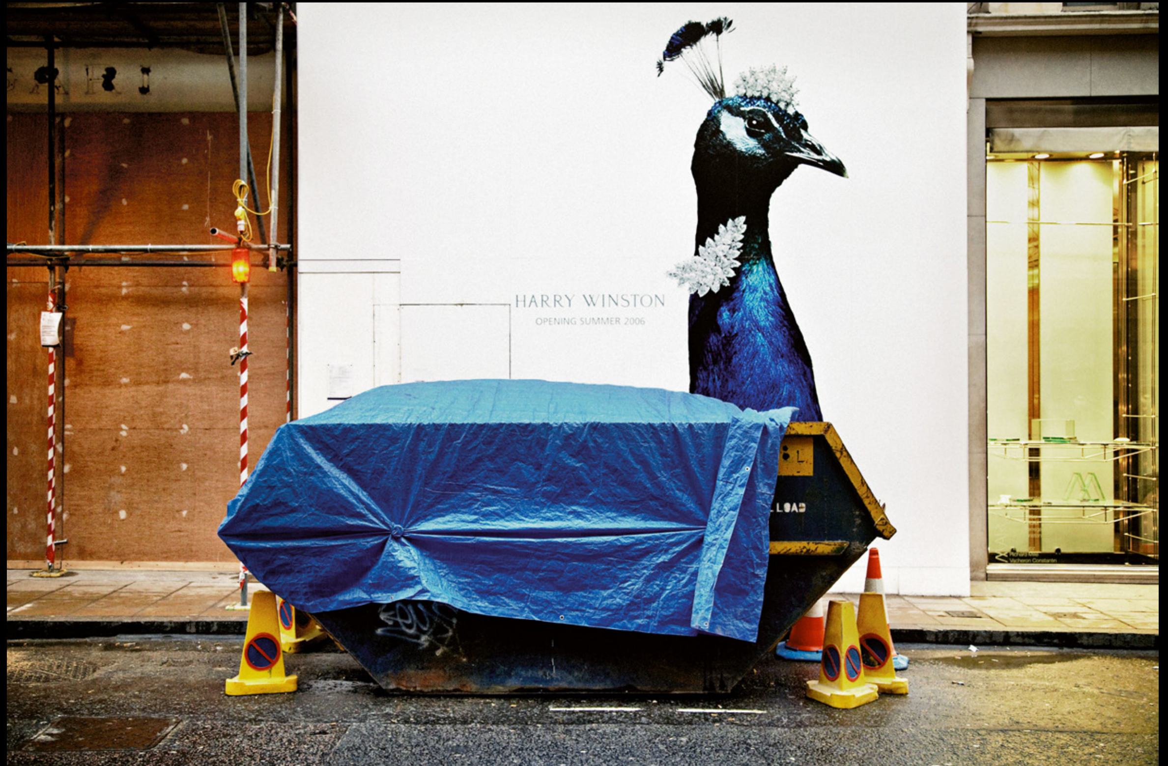
Matt Stuart New Bond Street, London, England, 2006.